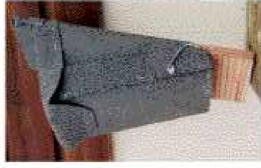
A "Wedge" made up with extra waterproofing