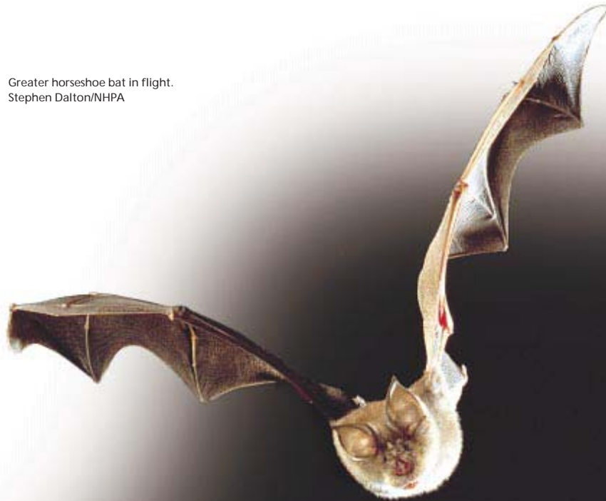
Greater horseshoe bat in flight.

Most churches, certainly in southern England, are used by bats at some time of the year, though they're rarely found in belfries, which are too exposed and draughty. In most cases, the number of bats seems small and the only problem is a scattering of droppings, which can easily be swept away. Occasionally, urine spotting appears on brass, marble or polished surfaces. This can be minimised by treating floors or polished surfaces with an emulsion wax polish, and brass with a strippable lacquer. A few churches may have larger numbers of bats and, here, specific advice on the management of the colony may be needed.