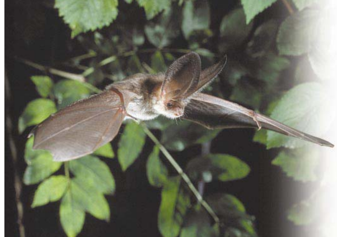
Brown long-eared bat.