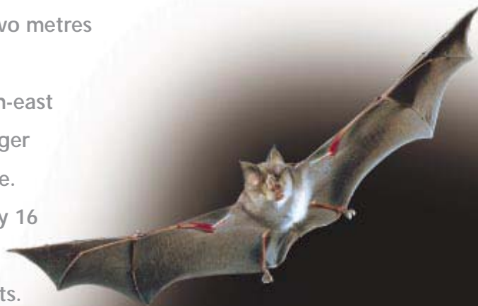
Greater horseshoe bat, one of our largest species.

In many parts of the world, including Britain, bats have declined drastically in recent years. Although we don't have much historical information, it's clear that our bats are under threat and many species are now much less common than they were. One species, the mouse-eared bat, is more or less extinct in Britain and several others are very rare.