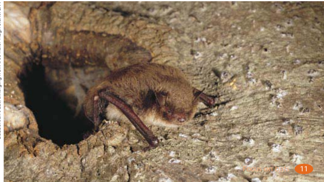
Daubenton's bat, emerging from tree hole.

Sometimes bats flying in buildings can set off burglar alarms, including those that use light beams, microwave or ultrasonic detectors or passive infra-red sensors. Persistent problems can usually be solved by moving the detectors, installing additional sensors or changing the system, for example to modern pulse-count detectors, which are resistant to false alarms.