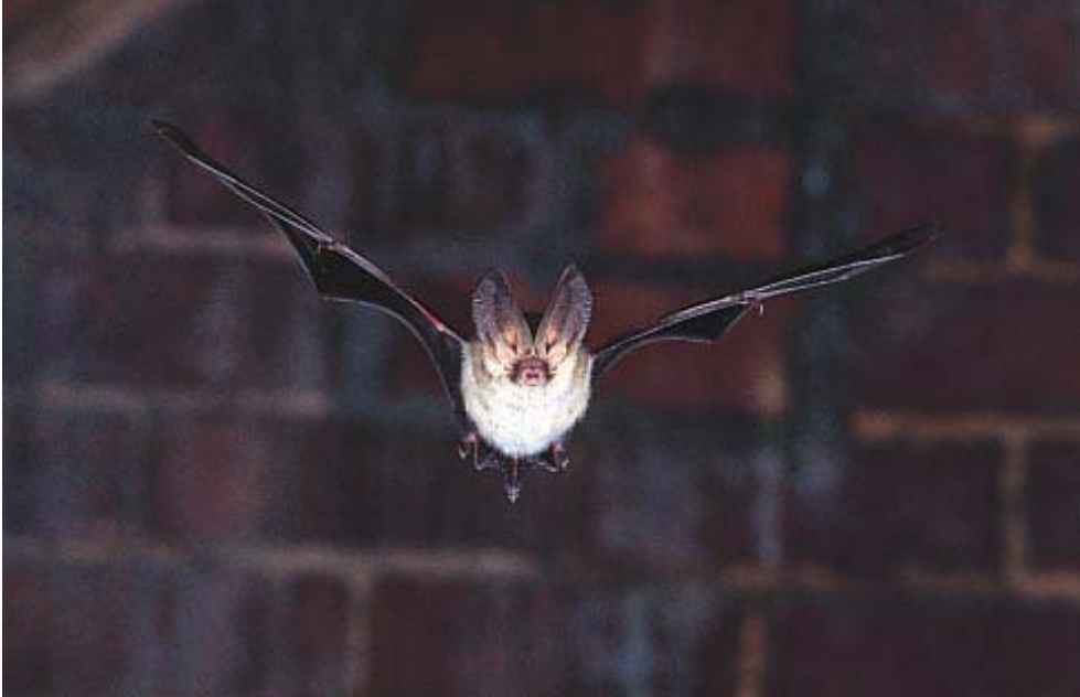
Brown long-eared bat in house roof.