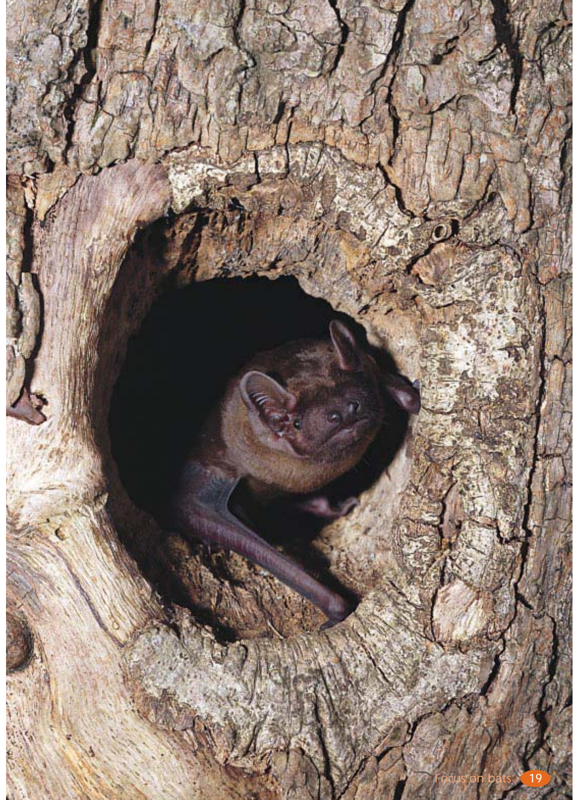
Noctule bat, a tree-dwelling species.

Bat Conservation International http://www.batcon.org