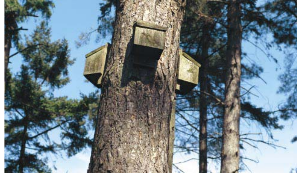
Bat boxes on trees in Cambridgeshire.

Many bats rely on underground sites such as caves, mines, tunnels, cellars and ice houses for hibernation or, occasionally, breeding. Unfortunately, these sorts of places are sometimes blocked up for safety reasons or by people dumping rubbish, so bats either lose their hibernation site or, worse still, are sealed up inside. If you're planning to block, cap, grille or demolish any sort of underground place which might be used by bats, consult English Nature before starting work. Also, try not to go into such places during the winter if you think bats may be hibernating there.