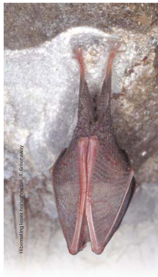
Hibernating lesser horseshoe bat. F. Greenaway

Most bats form social colonies for at least part of the year. Female bats gather together in maternity colonies for a few weeks during the summer to give birth and rear their babies. Once the baby is independent, the colony breaks up and the bats generally move to other roosts. Bats may gather together from over a large area to form these colonies, so any disaster at this summer breeding site can wipe out all the females from this area. During the winter, bats aren't often seen but clusters of hibernating bats are occasionally found in hollow walls when buildings are demolished, and are sometimes seen in buildings such as churches. Underground places such as caves, mines and cellars can house important numbers of bats during the winter and a few special sites are used by several hundred bats for hibernation.