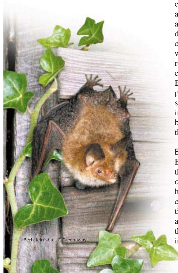
Bechstein's bat.

Most bat colonies live quite happily with their human landlords, but occasionally problems or concerns arise. However, most colonies are seasonal visitors and will leave of their own accord within a few weeks. If you are unsure about having bats in the roof, you must ask for advice from English Nature before doing anything yourself. Although it's illegal to kill bats, nobody has to have them in their home if they really don't want them and we'll give free advice on how to solve any problems.