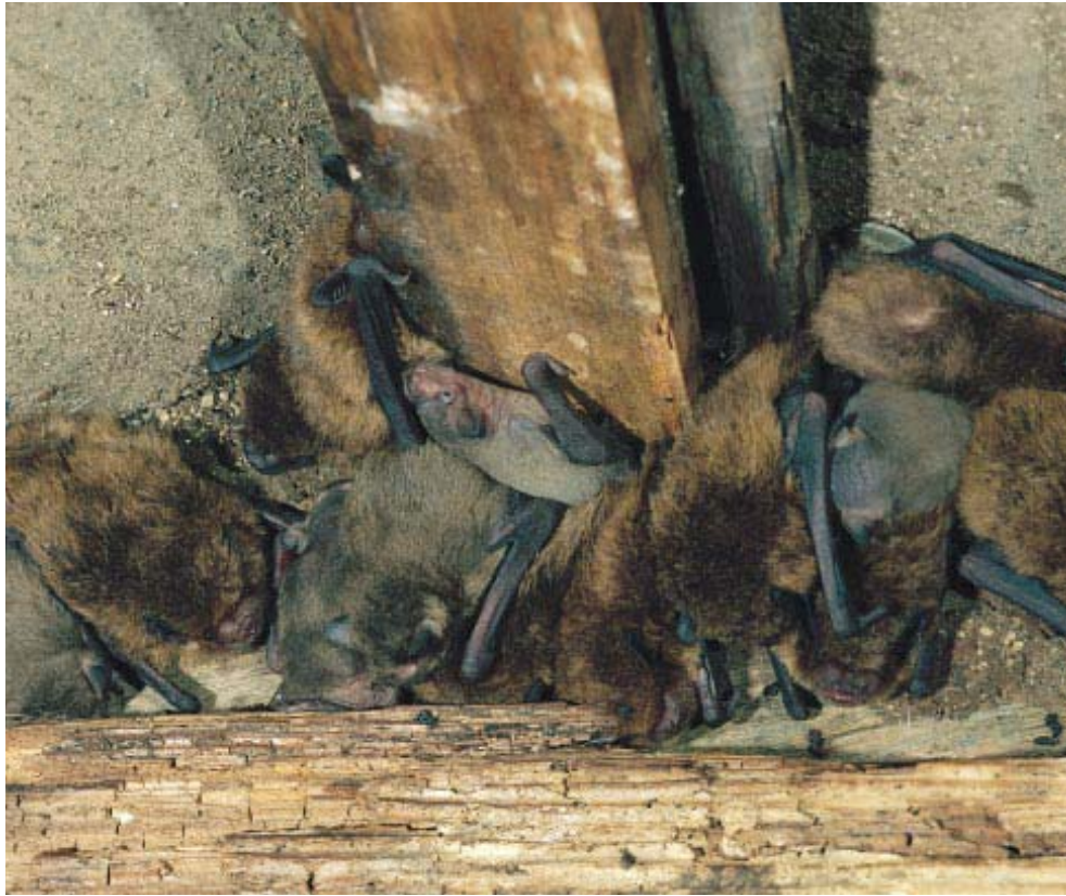
Pipistrelle nursery colony in a house roof. The young bats are grey.

followed by the young. Of course, different species have slightly different habits, but this seasonal pattern of use is common to all.