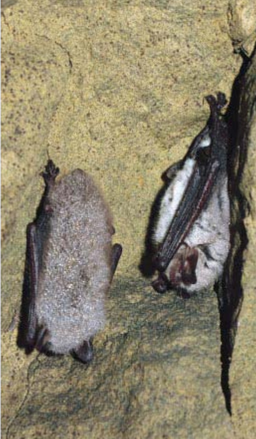
Whiskered bat and Natterer's bat in hibernation. The bats are so cold that condensation forms on their fur.