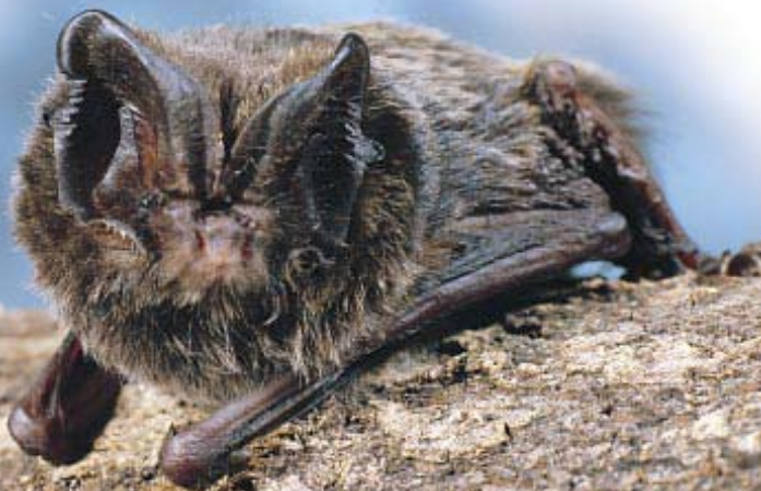
Barbastelle bat, one of our rarest species.

Each species has its own preferred types of roost. Some are almost always found in buildings, others rely on buildings during the summer and caves or mines during the winter whilst others prefer trees. Bats have well-established traditions and they tend to return to the same sites at the same time year after year. For this reason, their roosts are legally protected even if the bats don't seem to be there when you look.